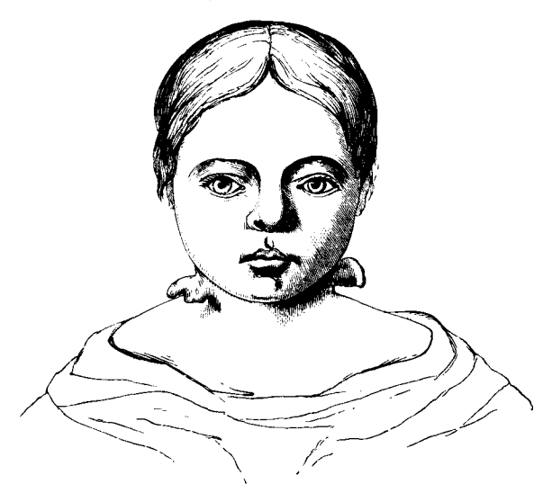
FIG. 28. Child having a well-developed supernumerary auricle on each side of the neck (from BIRKETT).

*145. A healthy female infant was brought to Guy's Hospital in 1851 on account of two projecting growths about the middle of the lateral cervical regions. The growths were not removed until February 1858, when they were found to have increased slightly. They were situated over about the centre of the sterno-cleidomastoid muscles. To the touch they resembled the tissue of the lobe of the auricle, and they contained within them a firm resisting nucleus like the cartilage of the same organ. They were also covered with peculiarly delicate, soft, downy hairs, like the lobe of the ear. They were excised without difficulty. Each was supplied with a small artery. They appeared to be intimately associated with the fibres of the platysma myoides, not dipping deeper than this structure, and to be entirely cutaneous appendages. (Fig. 28.)